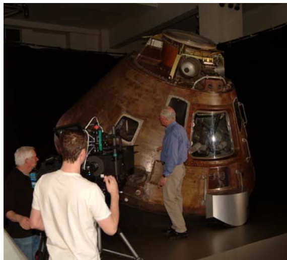
David Scott with Apollo command module during filming for 'Legend of Apollo'

The proposed storyline is an insight into the mission from some one who has actually experienced it...from launch pad ...to blastoff... to the long journey in space... to separation and lunar landing... to deployment of the lunar rover... to the return to earth. It will explore in the first person how the mission works in terms of human emotion....was it frightening, tedious, awe inspiring or something totally different?